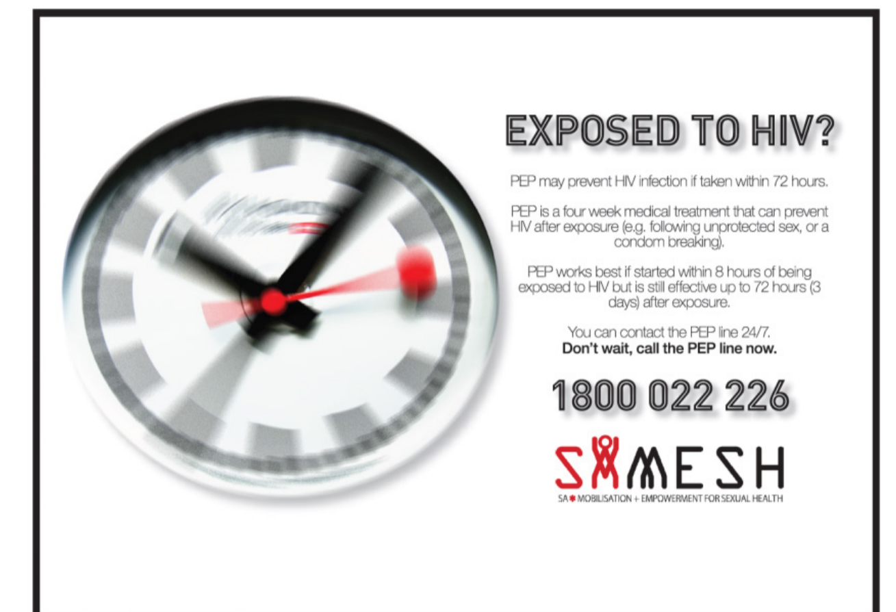
Campaign implementation has included sexual health with the Drama Downunder, PEP awareness and syphilis testing and treatment.