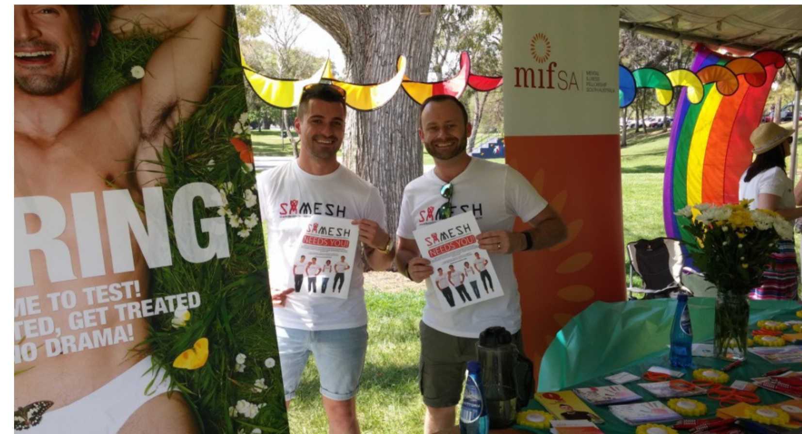
Community mobilisation around sexual health is supported by campaign implementation.